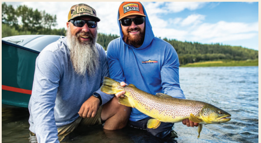
Bow River Guided Fishing Trip for 2 from Trout Farmer.

Package Includes: 4 Gold Zone Game Tickets vs Edmonton, 4 Stamps House Passes and 4 Pre-game Sideline Passes.