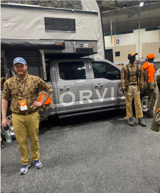
Geared out for pheasants!