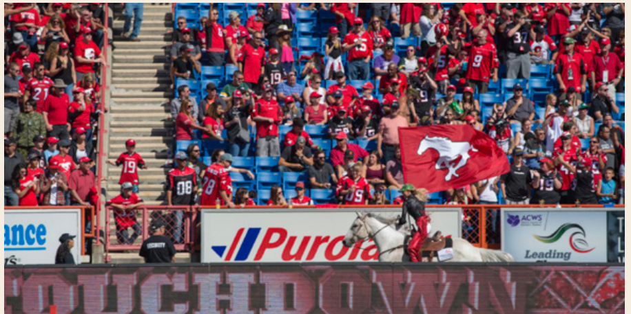
STAMPS HOUSE - Labour Day Classic Ticket Package

Package Includes: 4 Gold Zone Game Tickets vs Edmonton, 4 Stamps House Passes and 4 Pre-game Sideline Passes.