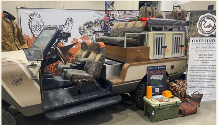
Geared out for pheasants!