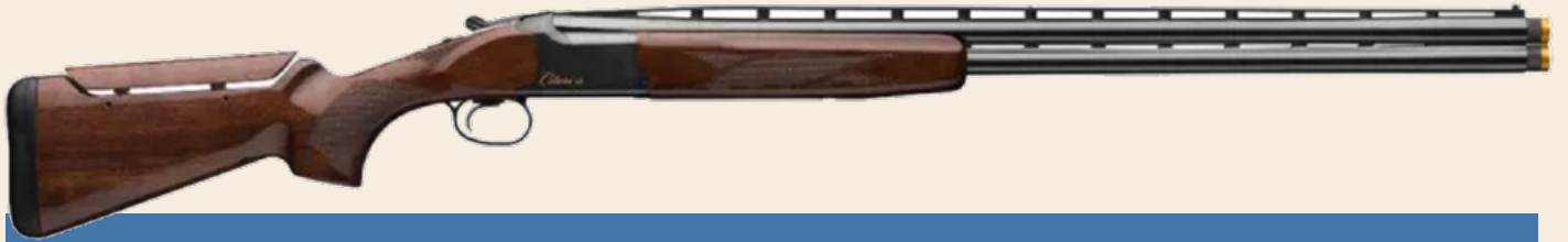
Browning Citori CX with Adjustable Comb