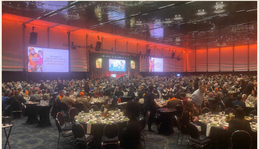
A packed house for the Bobwhite Ball!