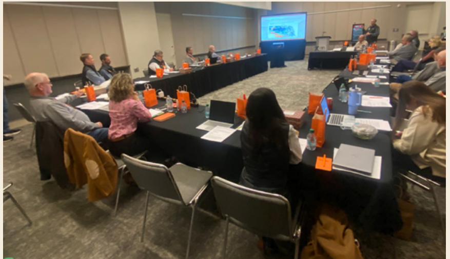
Pheasants Forever Board Meeting during Pheasant Fest.