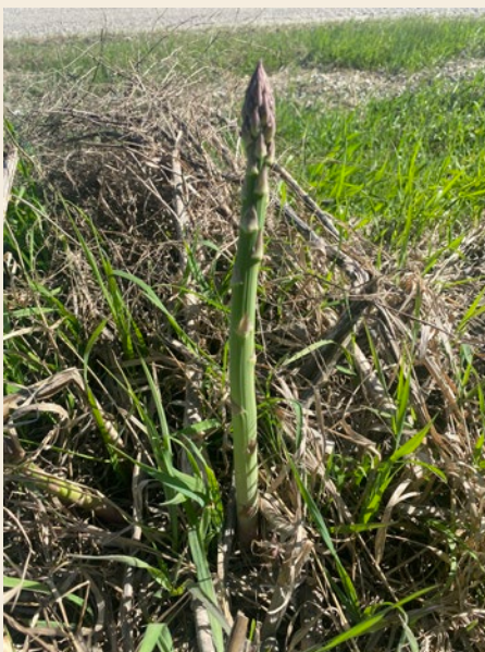
Asparagus this May.

Wild asparagus – one more reason to keep Alberta's roadside ditches intact!