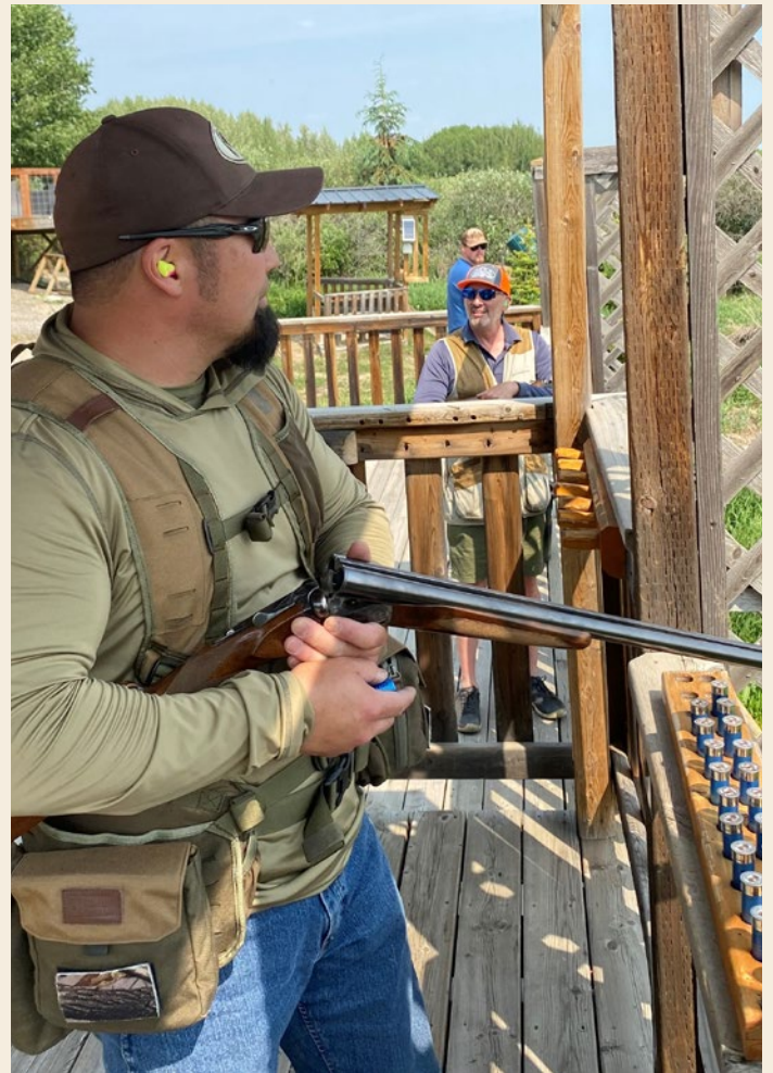
Conservation Partner's Alberta Conservation Association fielded a team.