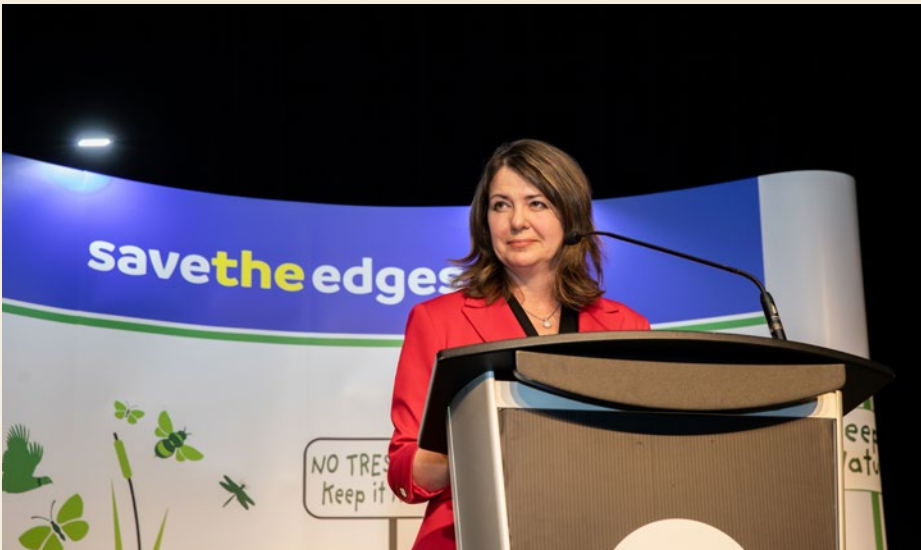
Alberta Premier Danielle Smith addresses sold out crowd.