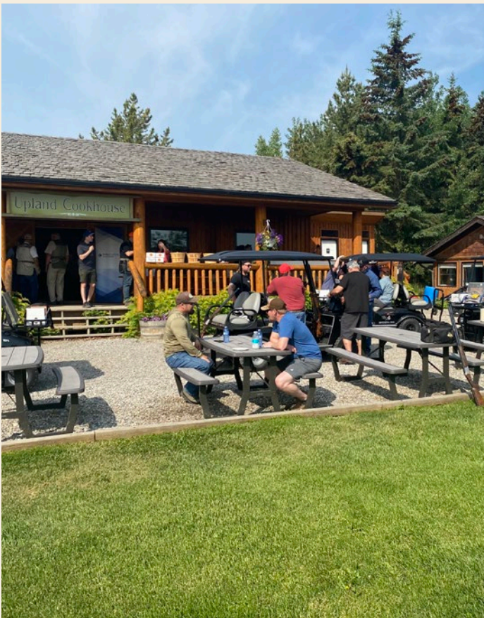
Safety rules are part of the protocol.