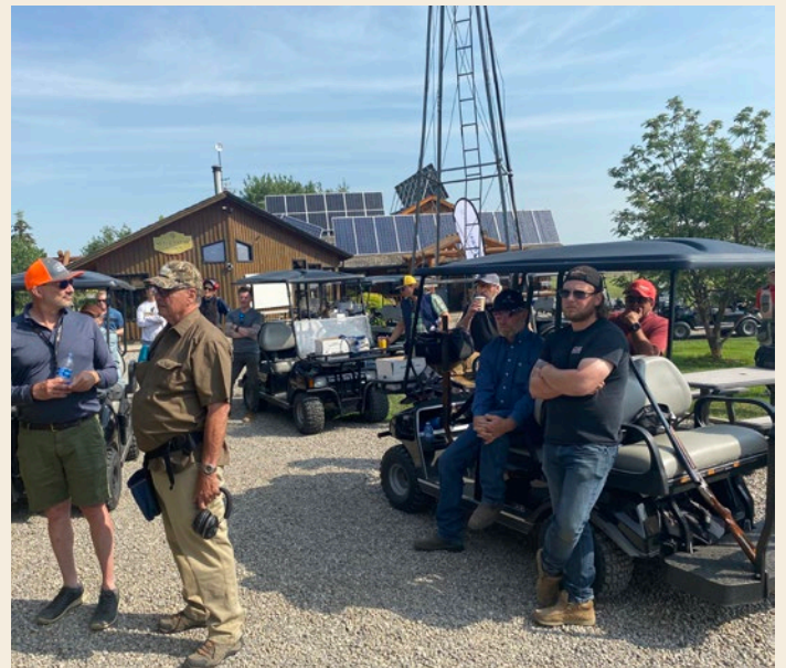
Loading up the carts.