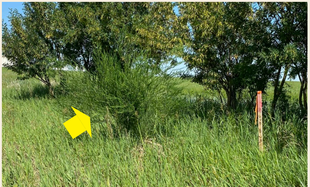
Asparagus is seeding out now and are easy to spot. They look like fern bushes, growing up to five feet tall. Mark the spot and return next May to harvest.