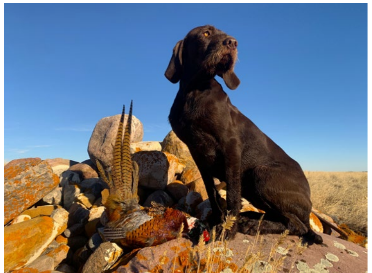
By Cornell Yarmoloy