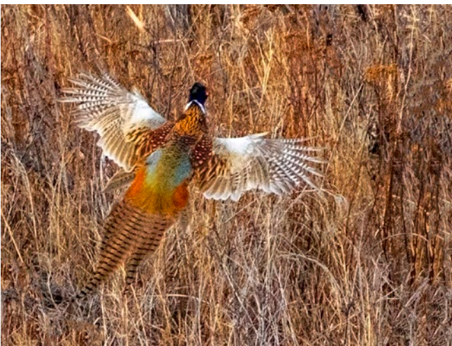
by Carl Marr