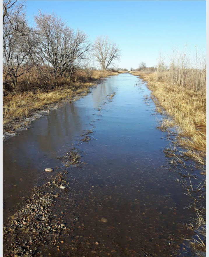
Undeveloped road allowance on the north boundary of the Ross Creek Conservation Site. Flood mitigation work will greatly reduce the risk of this repeating.

The goal of this project is to establish a series of cattail marshes providing winter thermal cover for wildlife, minimize downstream flooding and filter the creek water before it reaches the South Saskatchewan River.