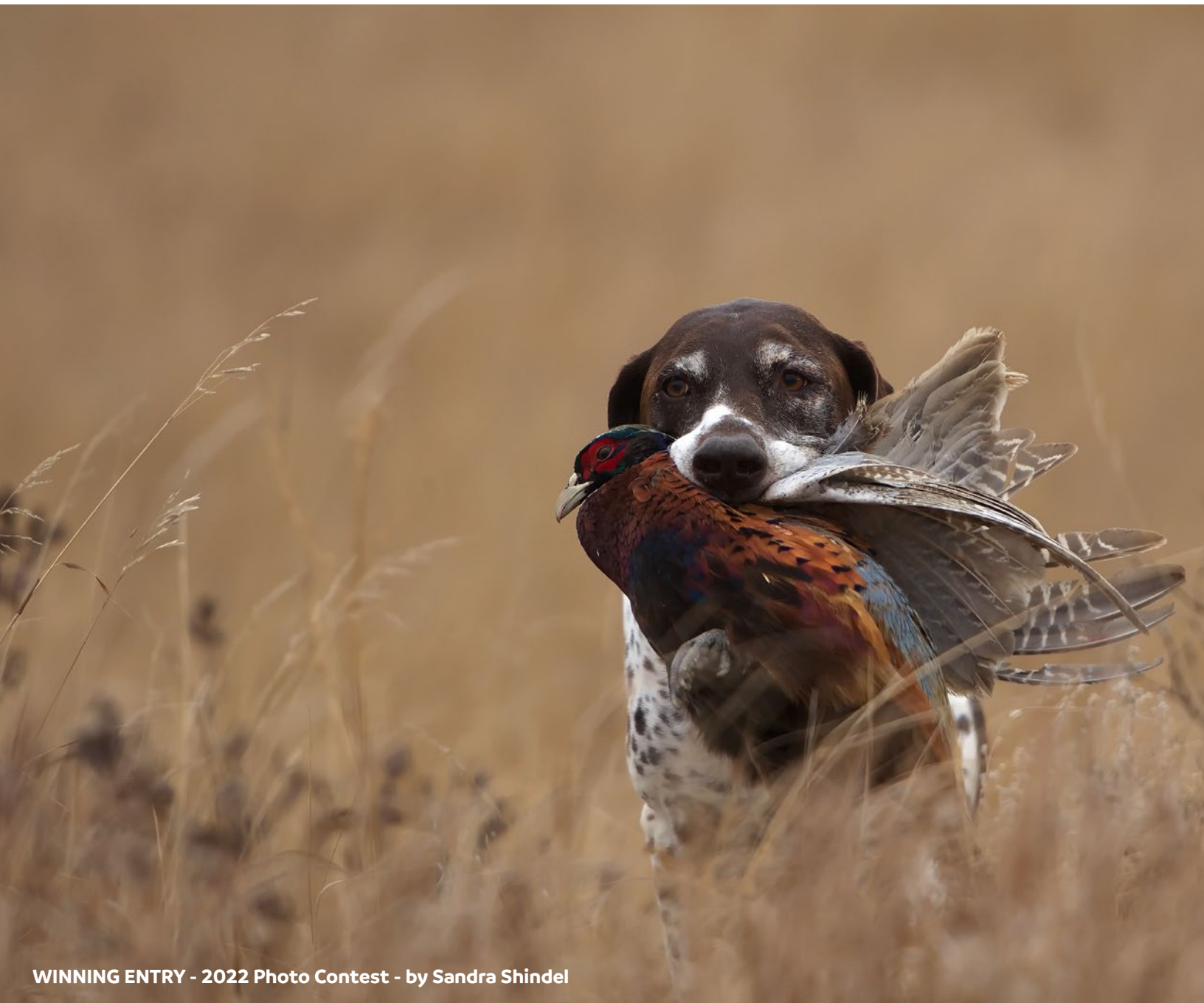
WINNING ENTRY - 2022 Photo Contest - by Sandra Shindel

PHEASANTS FOREVER CALGARY NEWSLETTER Created for our members by our members