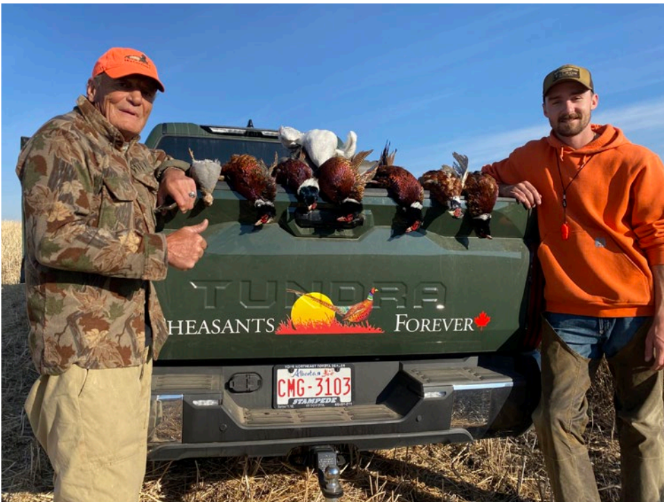
The new Tundra - the ultimate bird hunting machine.