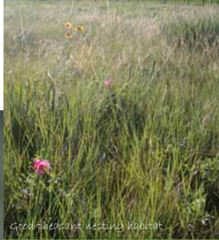
Good pheasant nesting habitat