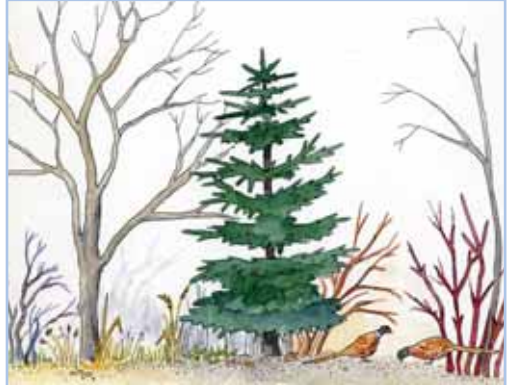
Both vertical and horizontal layers of cover add thermal insulation.

Cover is also important to provide hiding places and escape routes from hungry predators such as coyotes and birds of prey.